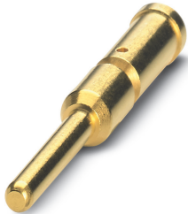
Crimp contact, turned, contact diameter: 2 mm, crimp range: 0.25 mm² ... 1 mm²

Please be informed that the data shown in this PDF Document is generated from our Online Catalog. Please find the complete data in the user's documentation. Our General Terms of Use for Downloads are valid ( http://phoenixcontact.com/download )